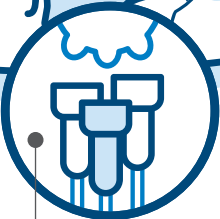
PRODUCTION OF RAW MILK